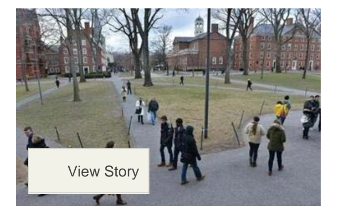
Editorial: Harvard must respect faculty, student privacy

can be used to answer a question doesn't mean that it should be. And if you watch people electronically and don't tell them ahead of time, you should tell them afterwards."