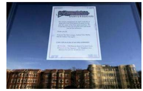
Bar closes amid Allston transformation

The firm bought its first property here a decade ago: two apartment buildings, which each received extensive makeovers. Over the past three years, the company