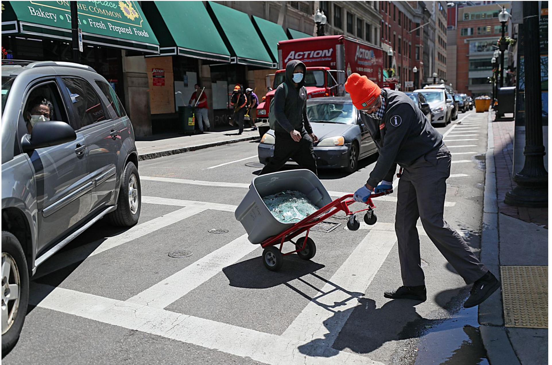
Workers began the cleanup in Downtown Crossing.