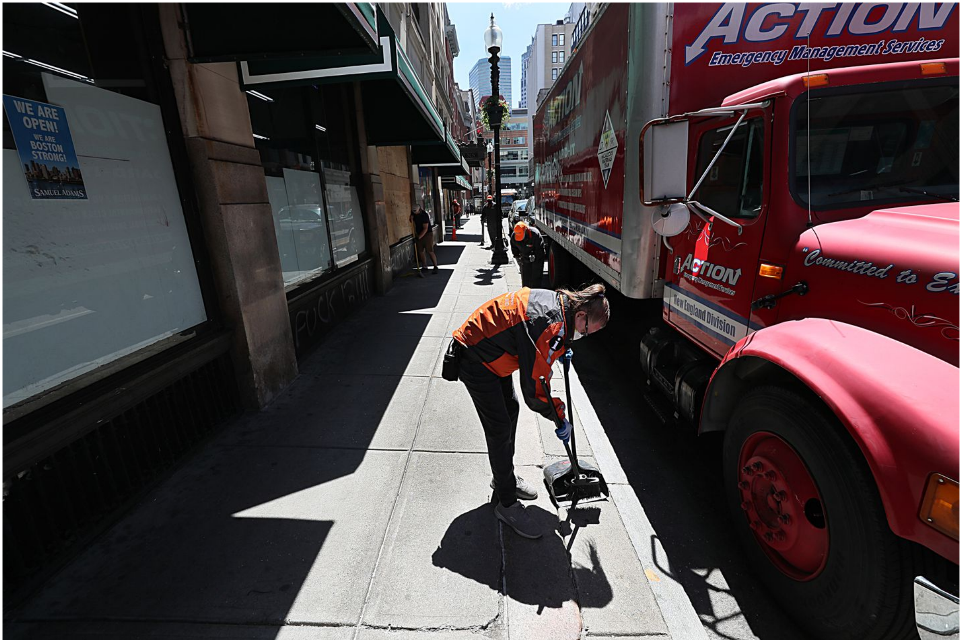
The cleanup began in Downtown Crossing.