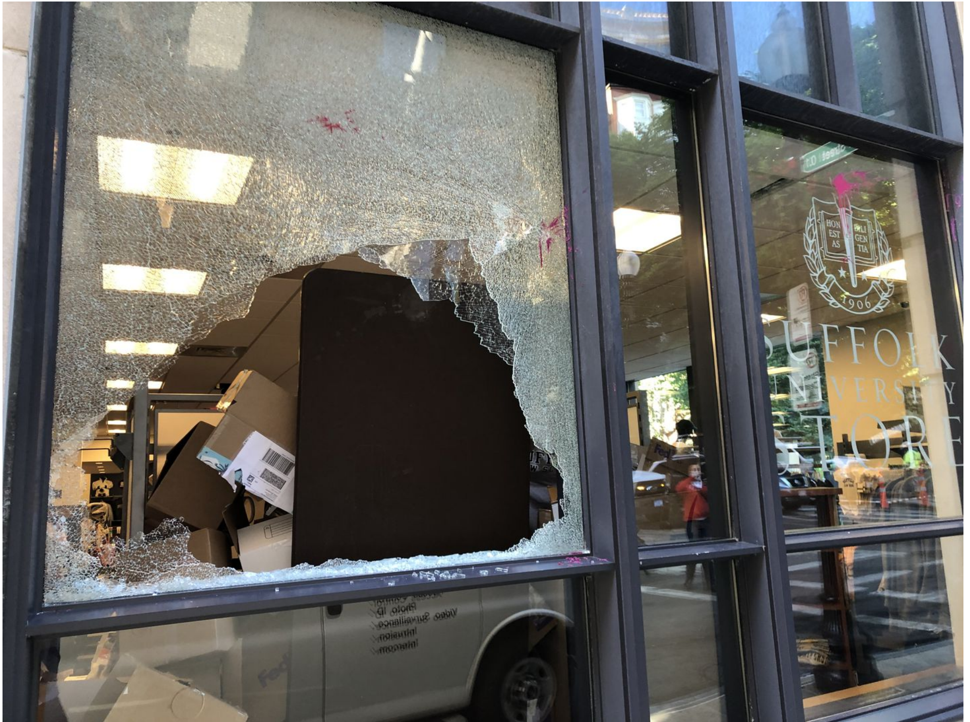
The glass windows of the Suffolk University store were shattered.