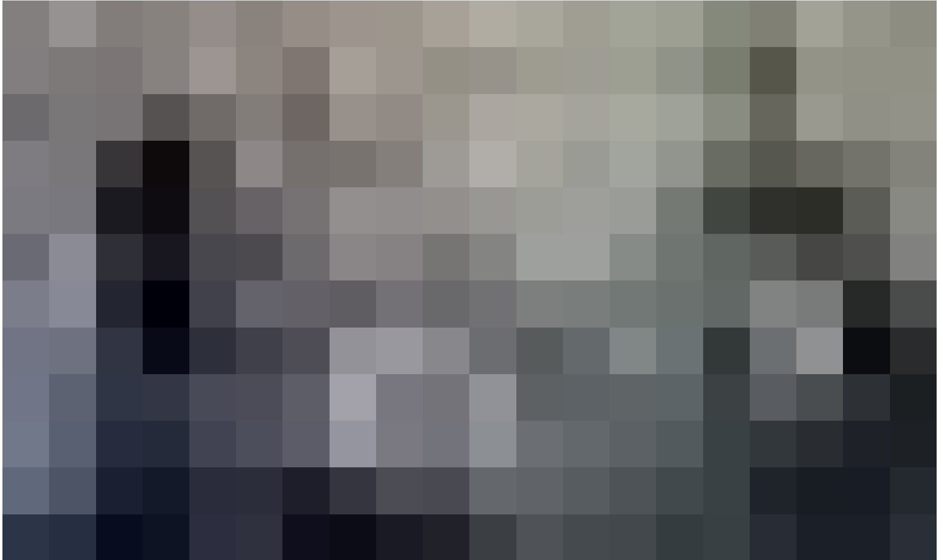
Volunteers cleaned up at the MBTA Park Street station building.