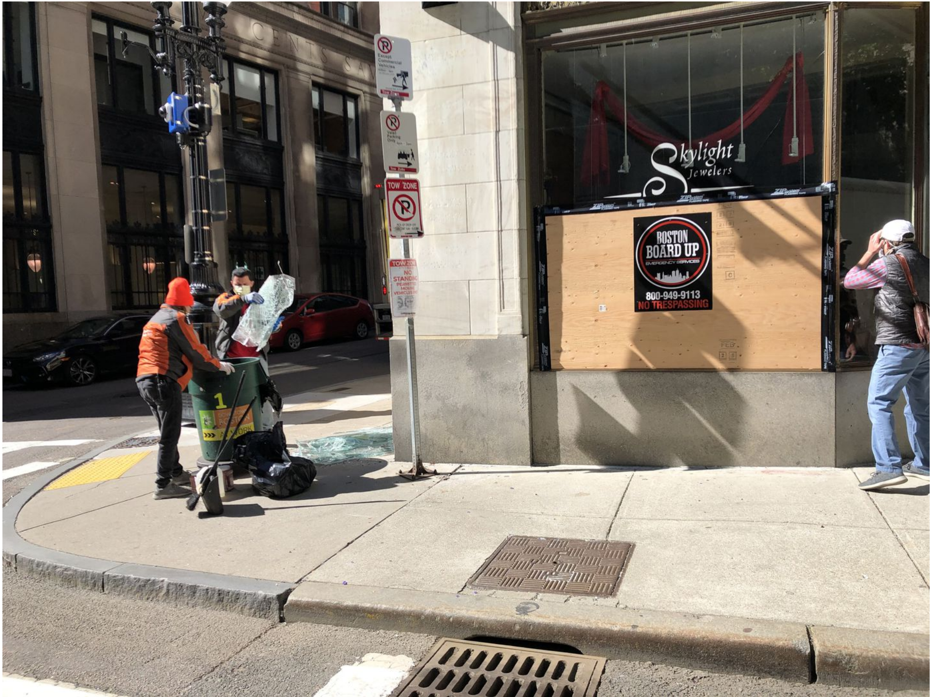
People cleaned up broken glass outside of Skylight Jewelers, which was broken into, in Boston on Monday.