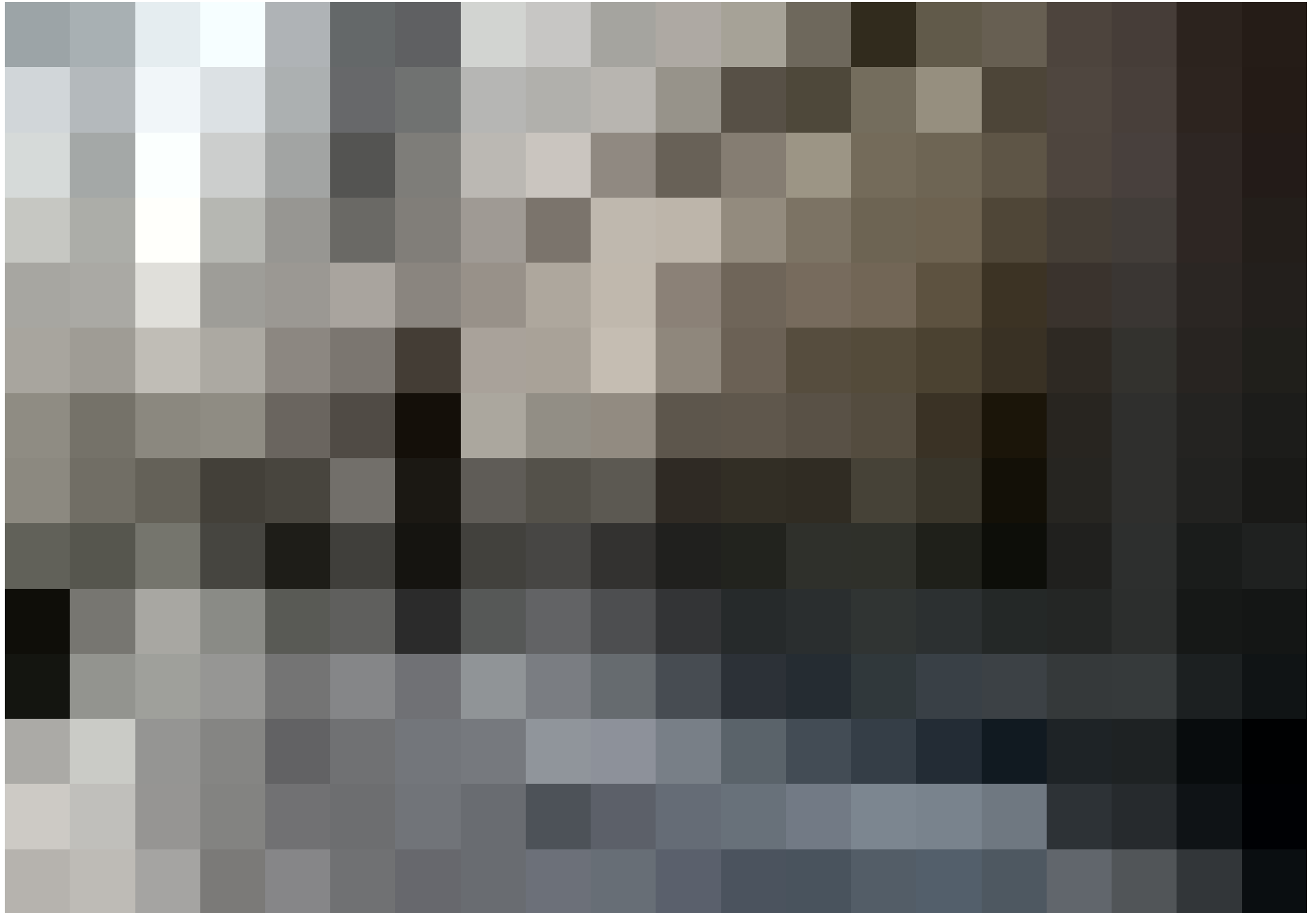
A man walked past the shattered storefront of an empty retail space in Downtown Crossing.