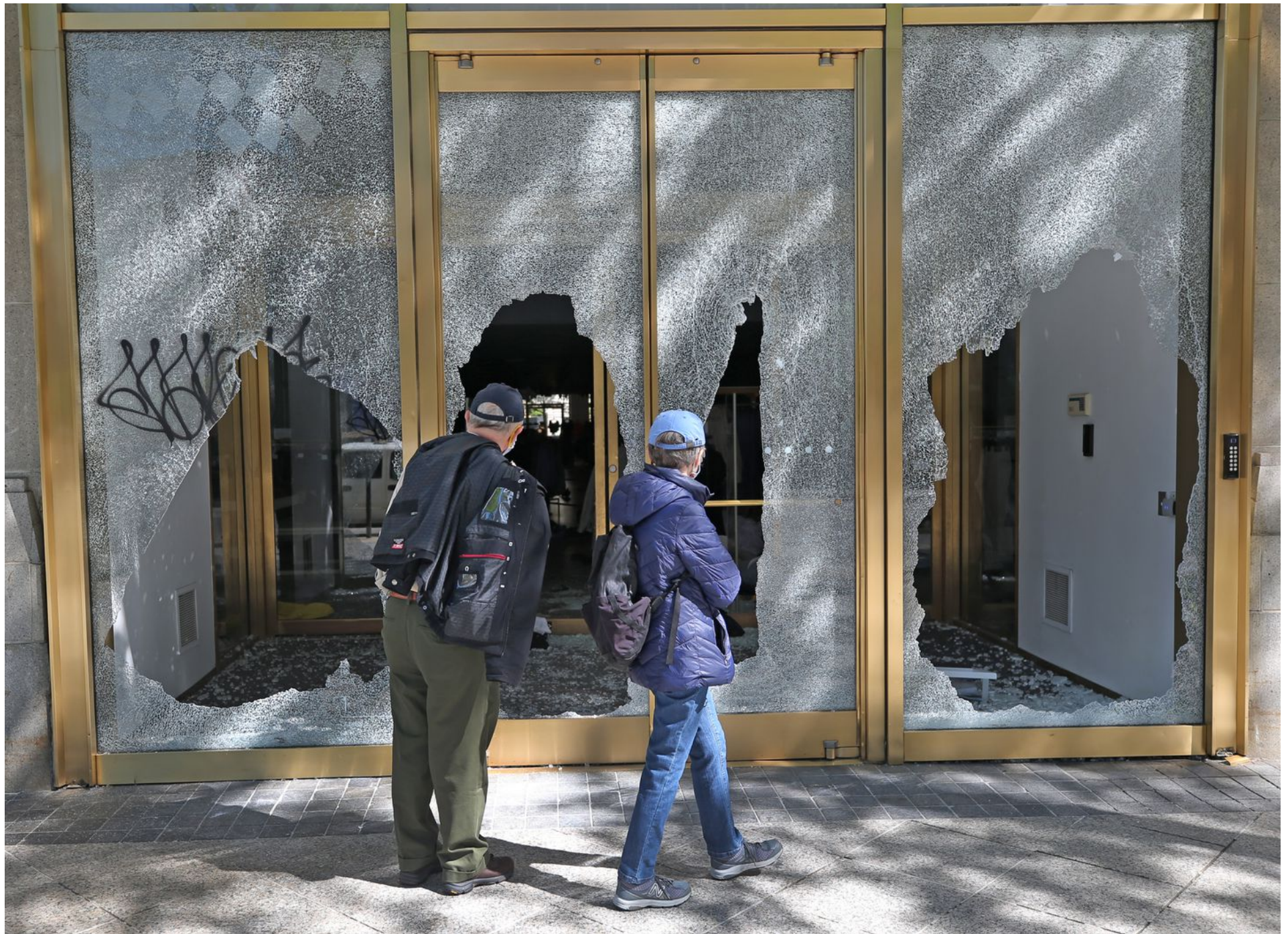
A couple viewed broken glass at the H&M storefront on Boylston Street.