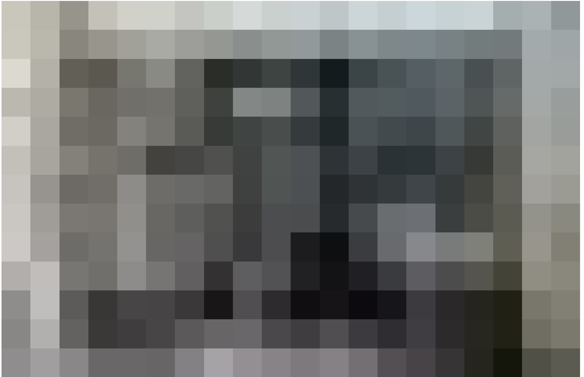
A man worked on cleaning up glass on the inside of Bromfield Nails near Downtown Crossing.