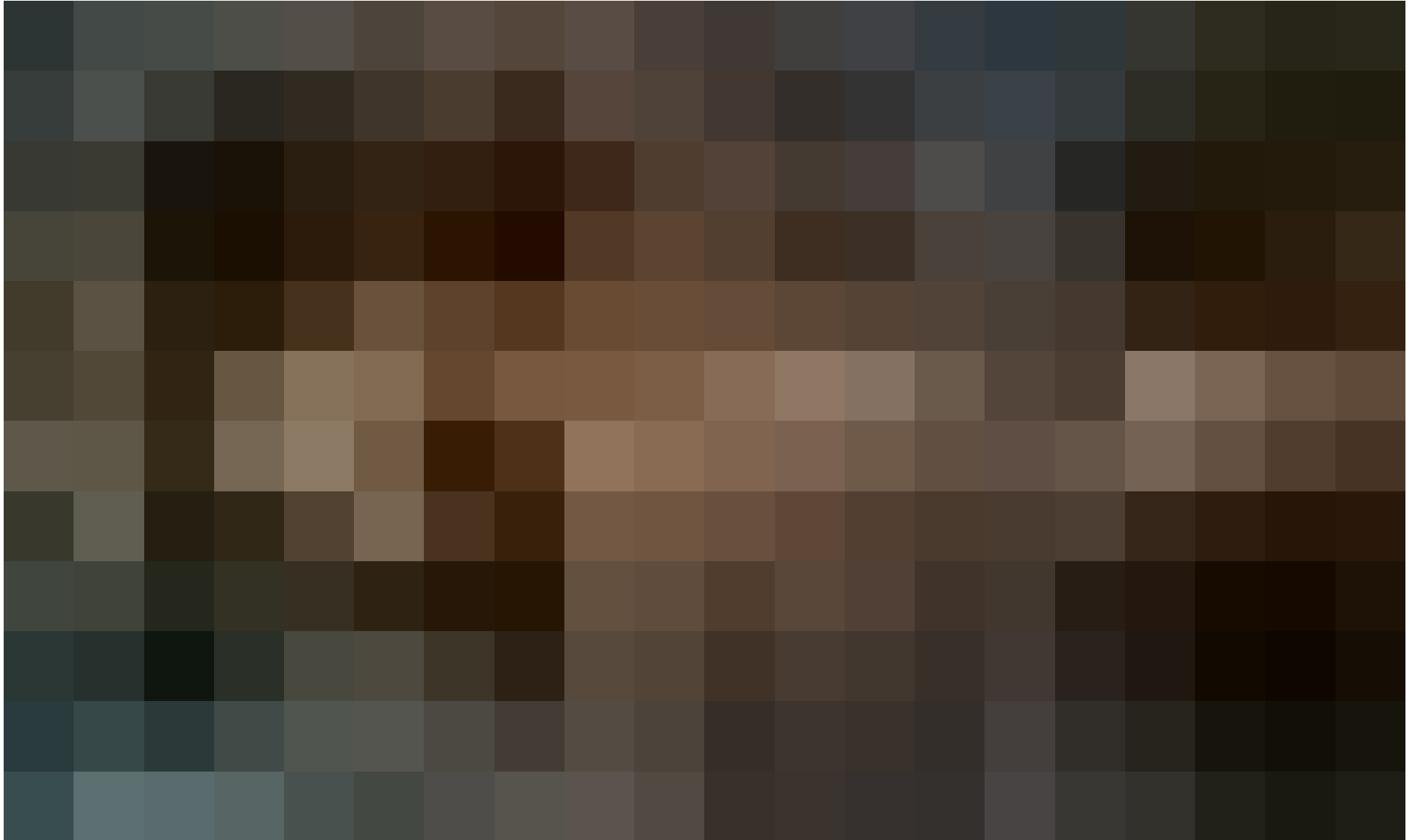
A man is reflected in the shattered storefront of retail space in Downtown Crossing.