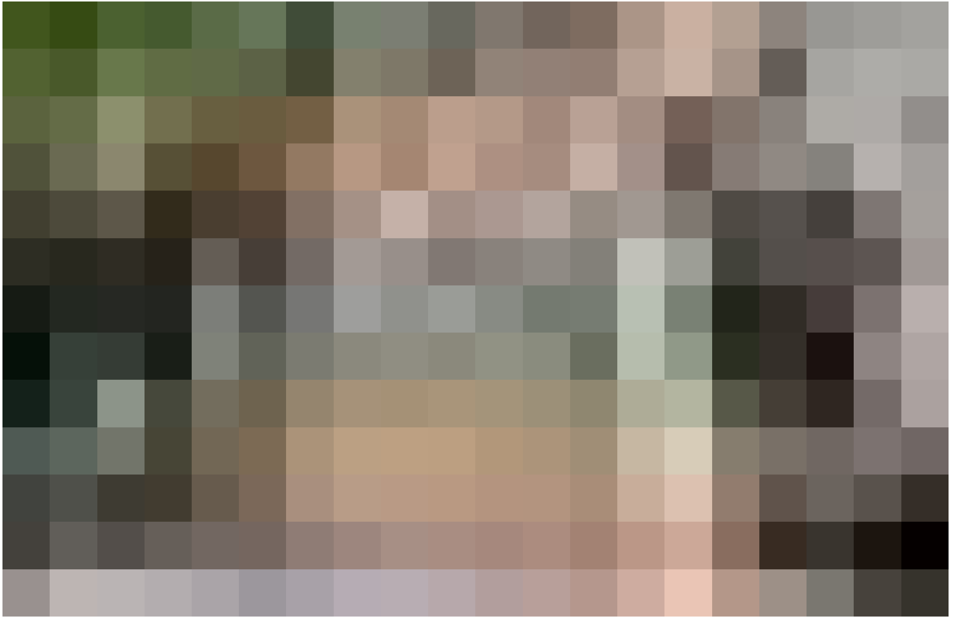
Workers boarded up a storefront on Newbury Street.