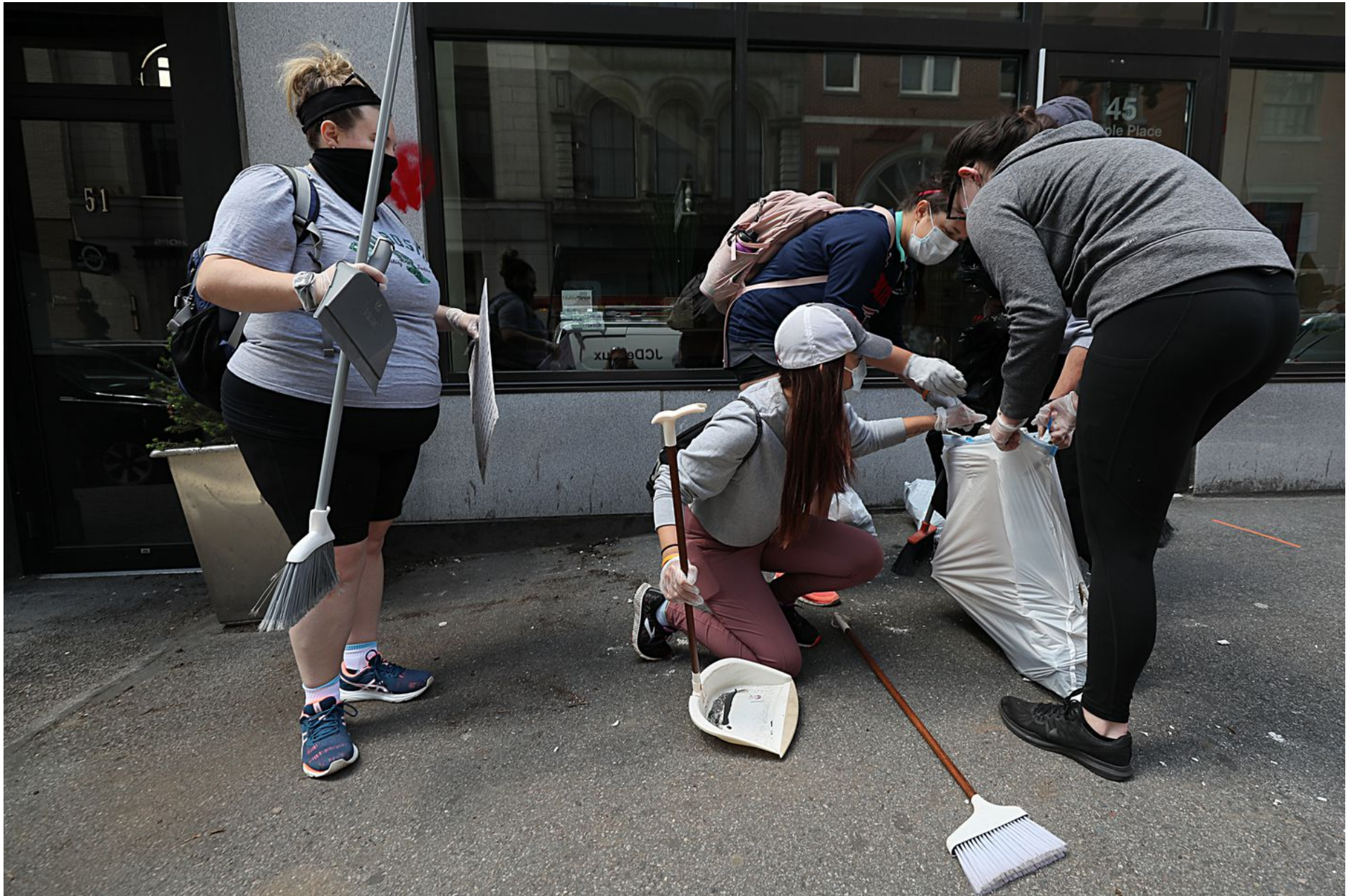
A group of volunteers from Medford who came and marched in the protest the night before, returned to Downtown Crossing to clean up after the damage from the people who got violent and looted.