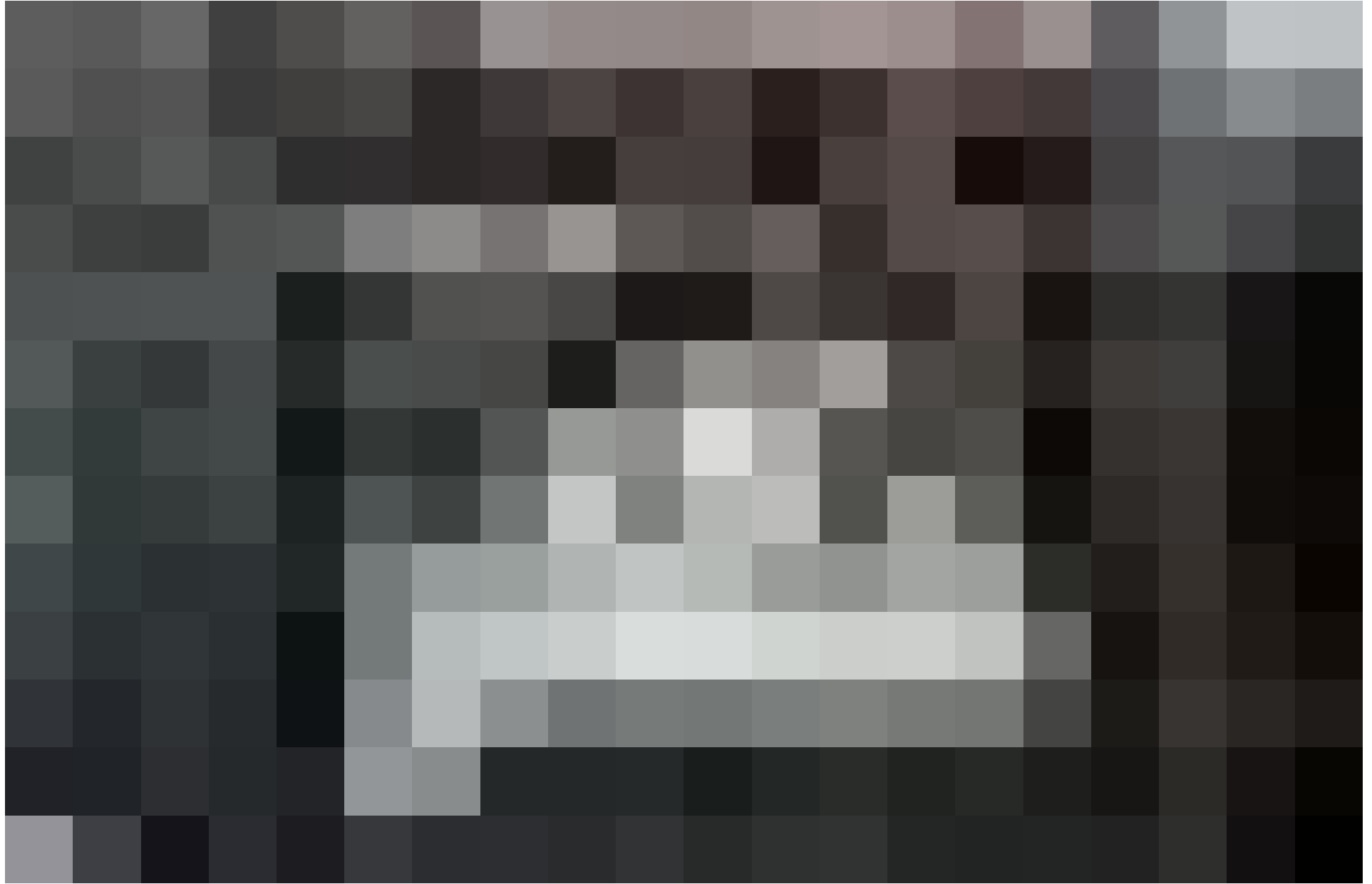
A shattered storefront window in Downtown Crossing.