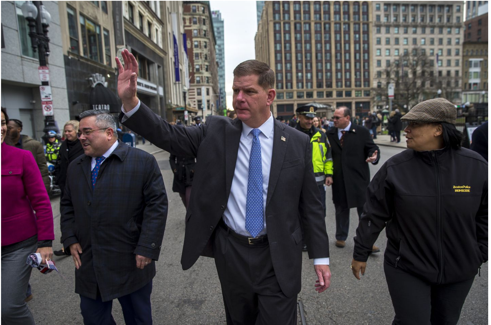
Boston Mayor Martin J. Walsh during the Veterans Day Parade in Boston on Monday, Nov. 11.

Boston Mayor Martin Walsh responded Saturday to a story published by the Globe Friday reporting that a federal grand jury is investigating accusations of overtime fraud in the Boston Police Department.