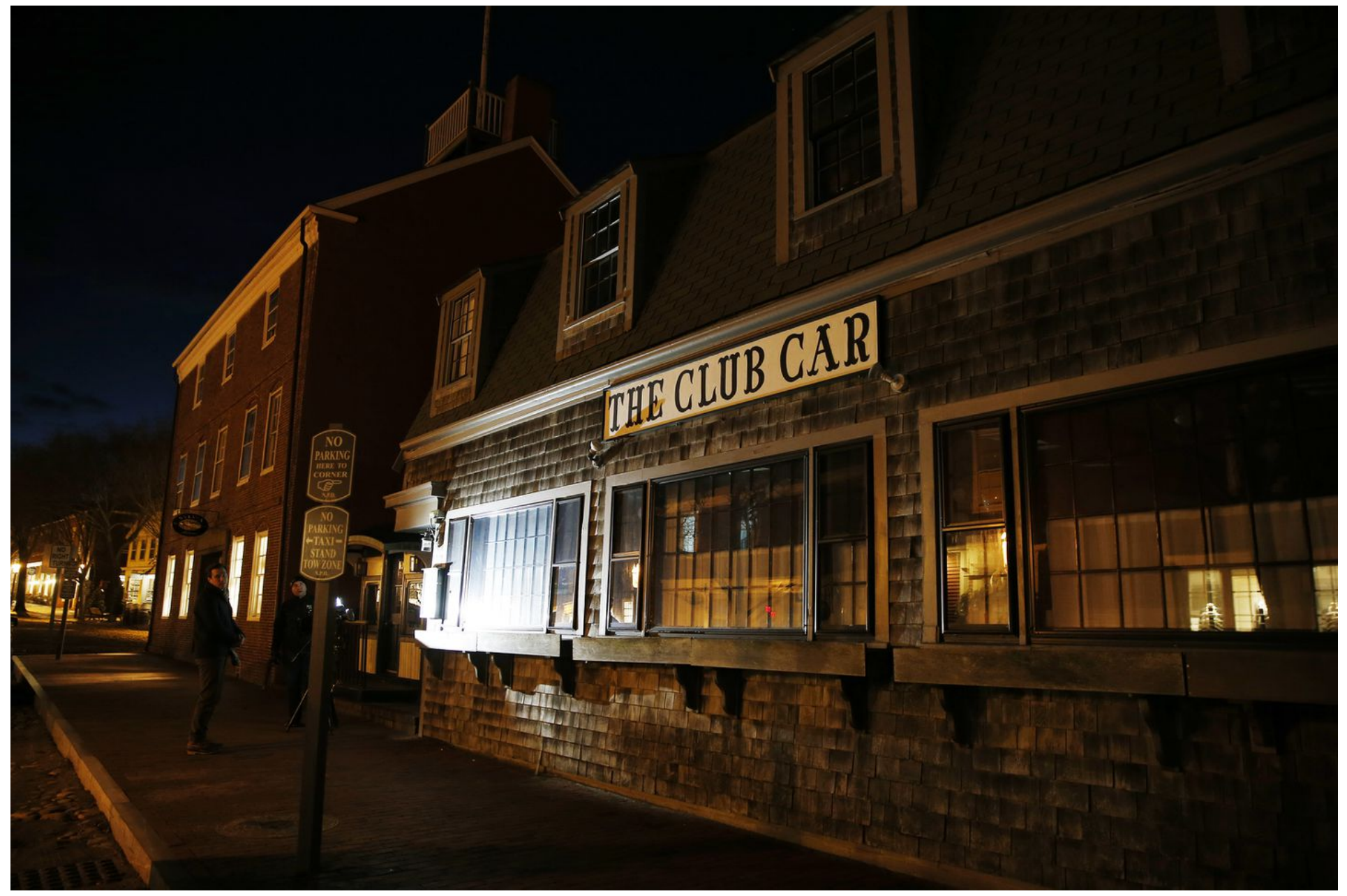
The text message exchange originated from the Club Car bar in Nantucket.

A newly released court filing in the criminal sexual assault case against actor Kevin Spacey shows a string of messages exchanged between the accuser and his girlfriend during critical moments of his encounter with Spacey.