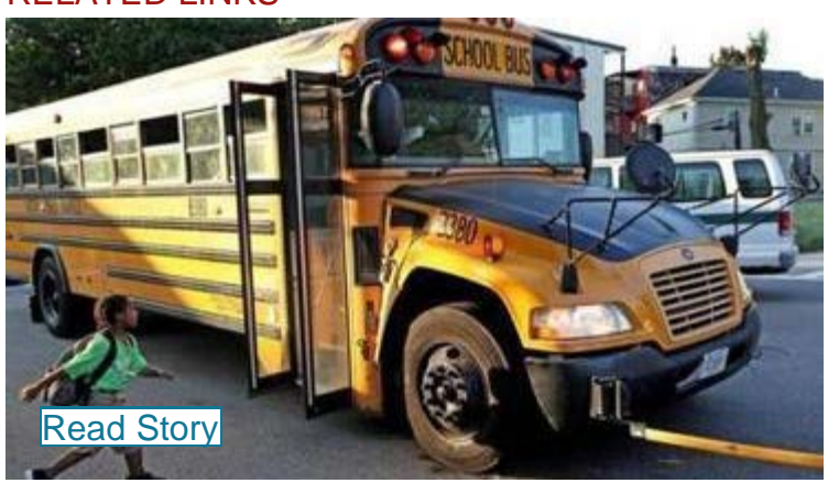
State will require new assistance to 230 struggling schools

Under a new system to be unveiled Thursday, the