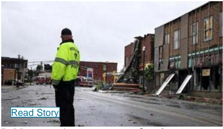
Is Mass. getting more tornadoes? The tornado that tore through Webster and Dudley on Saturday was the third twister to hit