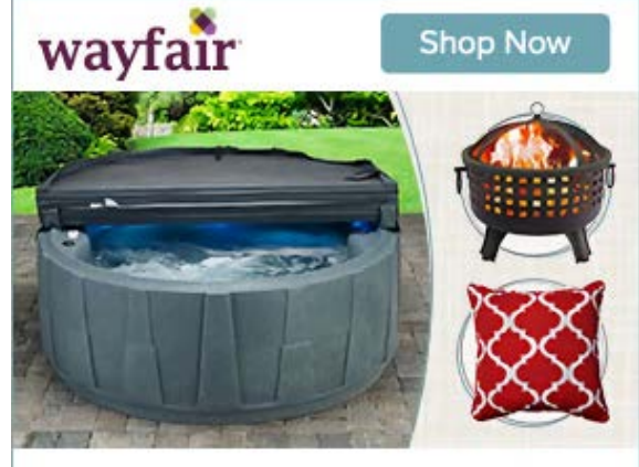
UP TO 70% OFF Everything Home

Rhode Island and Maine have each seen just slight population growth during the one- and five-year spans, while Vermont and Connecticut each had slightly lower populations in July than they did compared with the year before and five years before.