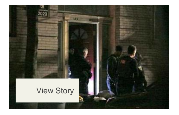
More than 400 officers fan out in sweep targeting MS-13 gang

Court documents filed by prosecutors in Friday's case say that members operate throughout the state, including in East Boston, Everett, Chelsea, Somerville, Lynn, and Revere.