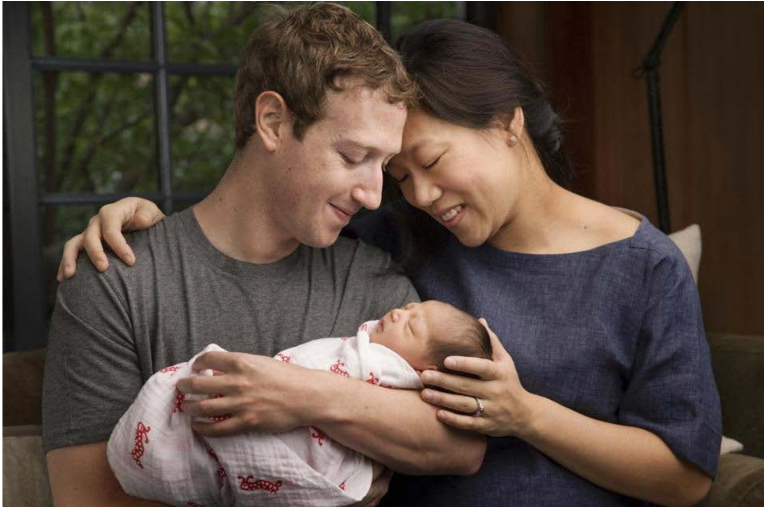
MARK ZUCKERBERG VIA AP