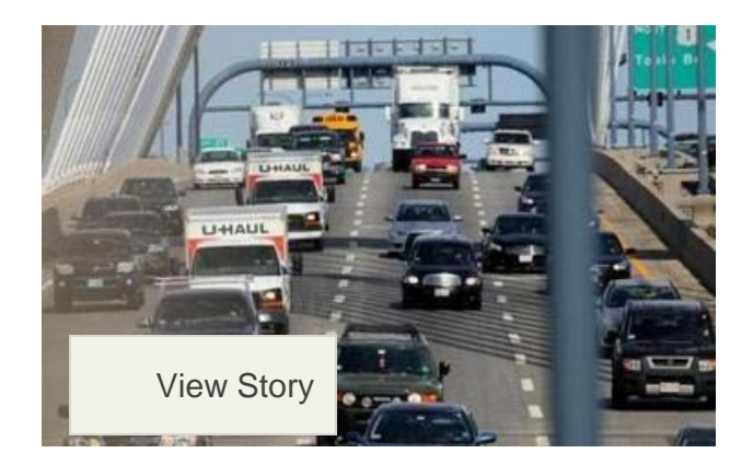
Study finds 3 worst highway bottlenecks in

The worst time to drive around the area has been around 5 p.m. Tuesday, according to Google's analysis which was based on speed and location data it collects from Google smartphone users. The company looked at data for the Tuesday before Thanksgiving through the Sunday after for 2012 through 2014.