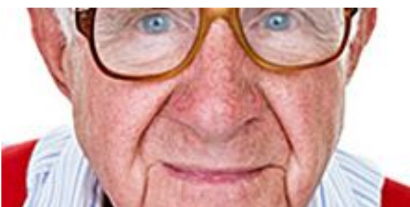
Social Security: How To Get $1,000 Glen Campbell Has Been Moved More a Month