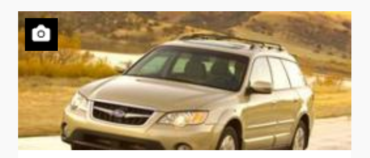
19 Best Cars, Vans, & SUVS for Families