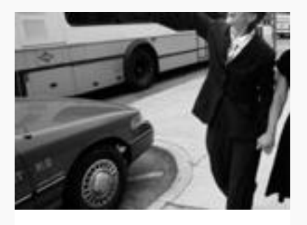
Celebrating 10 Yea Marriage