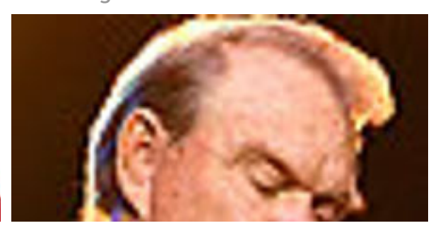
Into a Facility