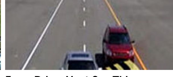
Every Driver Must See This... Lifestyle Journal