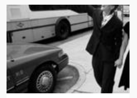
Celebrating 10 Yea Marriage