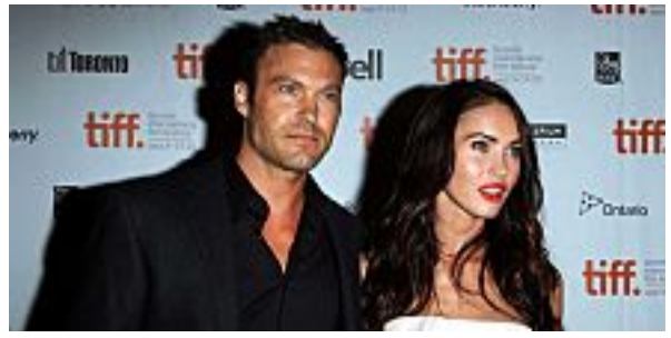
You Won't Believe Which 14 Famous Couples Have Open Marr... Extremely Expensive