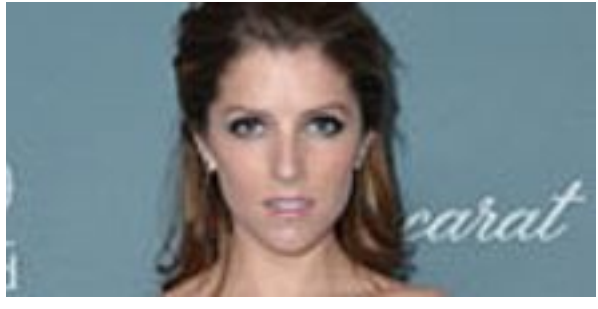
Top 20 Celebs Who Are Shockingly Classic golf mistake amateurs Small CelebZen