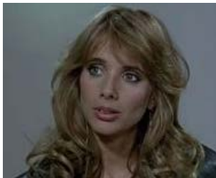
9 Awesome Movies That You Haven't Seen... And Should! Movies Talk