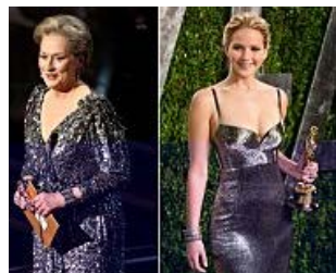
The New Hollywood A-List DailyCandy