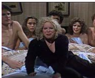
One of the Most Classic SNL Sketches of All Time Yahoo Screen