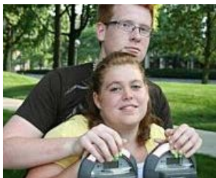
Eighteen Uncomfortable Engagement Photos Parent Media