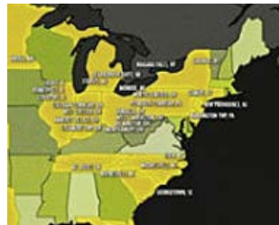
If You Ever Want to Retire Look at This Chart Money Morning