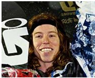
5 Richest American Olympians At Sochi