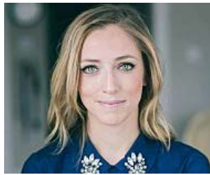
Turn Heads with This Makeup Trick