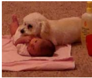
Watch This Pup Protect His Baby Sister