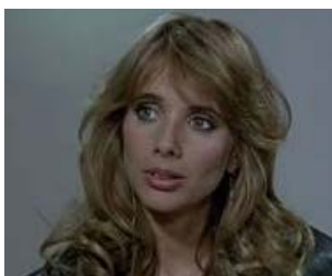
9 Awesome Movies That You Haven't Seen... And Should! Movies Talk