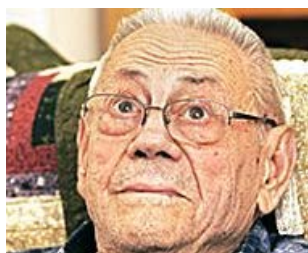
14 Benefits Most Seniors Didn't Know They Had Newsmax