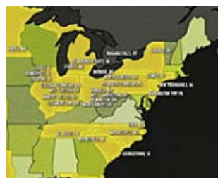
If You Ever Want to Retire Look at This Chart Money Morning