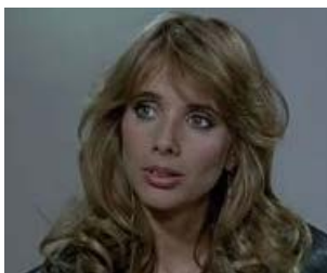
9 Awesome Movies That You Haven't Seen... And Should! Movies Talk