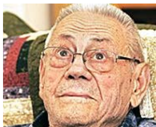
14 Benefits Most Seniors Didn't Know They Had Newsmax