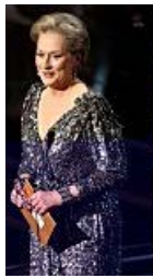
The New Hollywood A-List