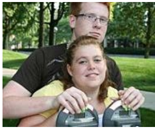
Eighteen Uncomfortable Engagement Photos