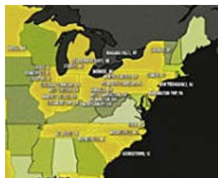
If You Ever Want to Retire Look at This Chart Money Morning