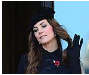
Kate Middleton's Bizarre Behavior at Event Gets Everyone Talking