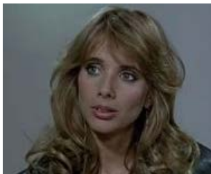
9 Awesome Movies That You Haven't Seen... And Should! Movies Talk