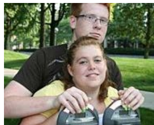
Eighteen Uncomfortable Engagement Photos Parent Media