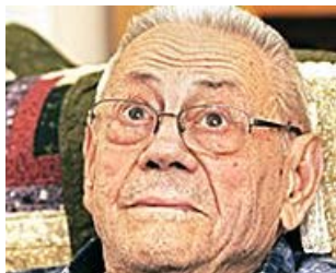
14 Benefits Most Seniors Didn't Know They Had Newsmax