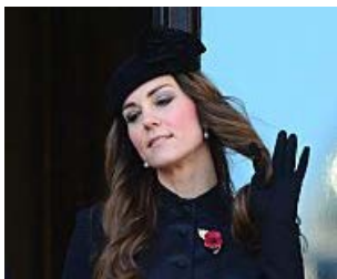
Kate Middleton's Bizarre Behavior at Event Gets Everyone Talking Stirring Daily