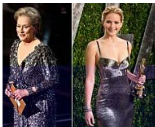
The New Hollywood A-List DailyCandy