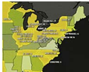
If You Ever Want to Retire Look at This Chart Money Morning