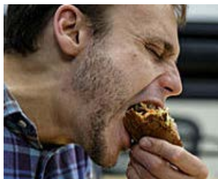
5 Foods You Should Never Eat Again My Diet