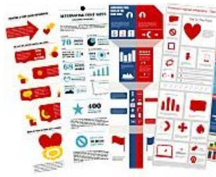
Easy Ways to Create Killer PowerPoint Infographics (Free Templates) HubSpot