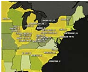
If You Ever Want to Retire Look at This Chart Money Morning