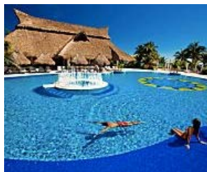
You Haven't Lived Until You Visit These 10 All-Inclusive Resorts TripCurator