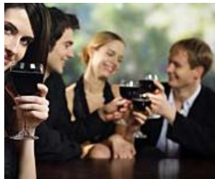
Millennials are Drinking so Much Wine They're Changing How it's Sold Parade