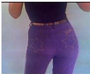
One of the Most Classic SNL Sketches of All Time Yahoo Screen