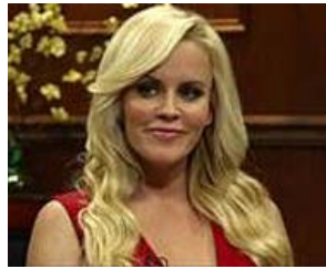
Jenny McCarthy Bares All Ora.TV