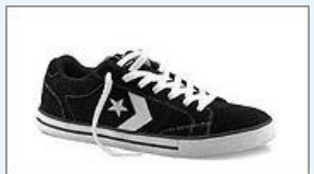
They kick it in Allston like no place else