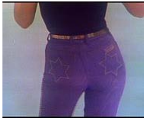
One of the Most Classic SNL Sketches of All Time Yahoo Screen