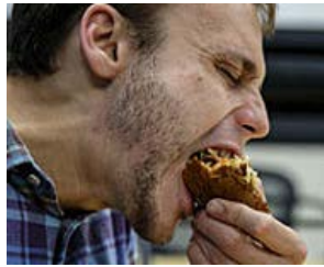
5 Foods You Should Never Eat Again My Diet