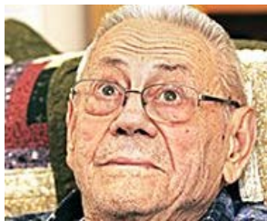
14 Benefits Most Seniors Didn't Know They Had Newsmax