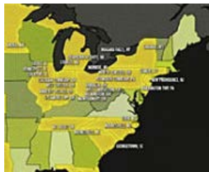
If You Ever Want to Retire Look at This Chart Money Morning