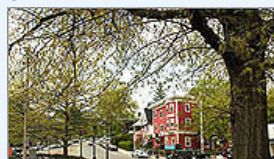
Harvard's new innovation lab