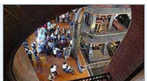
A look inside the new museum

Scituate police say man jumped out of car, onto the hood of another