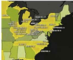
If You Ever Want to Retire Look at This Chart Money Morning