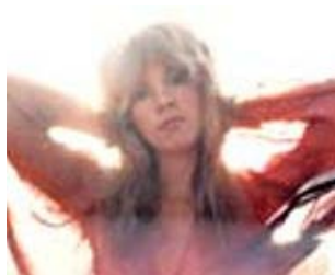
16 Songs Everyone Over 50 Should Own AARP