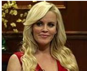
Jenny McCarthy Bares All Ora.TV