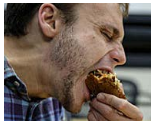
5 Foods You Should Never Eat Again My Diet