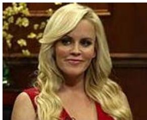
Jenny McCarthy Bares All Ora.TV