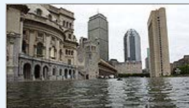
Past, future of Christian Science Plaza