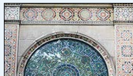
Tiffany mansion a Back Bay jewel