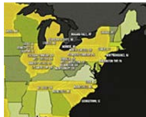
If You Ever Want to Retire Look at This Chart Money Morning