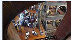
A look inside the new museum