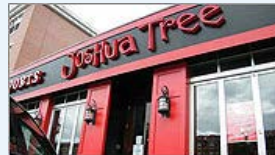
A turbulent year for Allston businesses