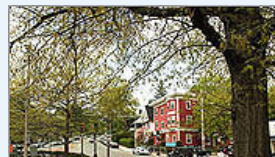
Harvard's new innovation lab