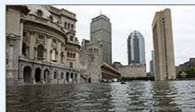
Past, future of Christian Science Plaza