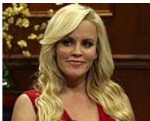
Jenny McCarthy Bares All Ora.TV