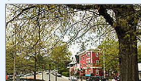
Harvard's new innovation lab