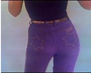
One of the Most Classic SNL Sketches of All Time Yahoo Screen