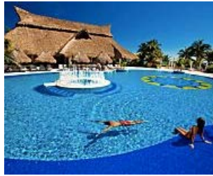
You Haven't Lived Until You Visit These 10 All-Inclusive Resorts TripCurator