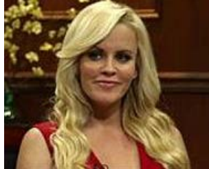
Jenny McCarthy Bares All Ora.TV