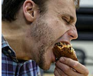
5 Foods You Should Never Eat Again My Diet