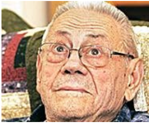
14 Benefits Most Seniors Didn't Know They Had Newsmax