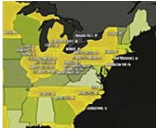
If You Ever Want to Retire Look at This Chart Money Morning