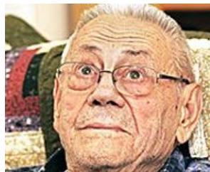
14 Benefits Most Seniors Didn't Know They Had Newsmax