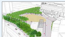
Picture the plaza with trees