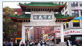
A tour of the historic neighborhood