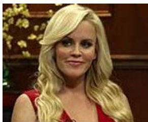
Jenny McCarthy Bares All Ora.TV