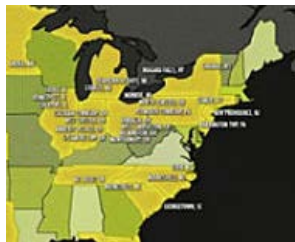
If You Ever Want to Retire Look at This Chart Money Morning