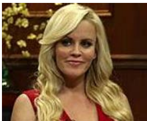
Jenny McCarthy Bares All Ora.TV