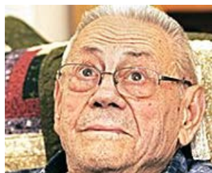
14 Benefits Most Seniors Didn't Know They Had Newsmax