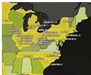
If You Ever Want to Retire Look at This Chart Money Morning