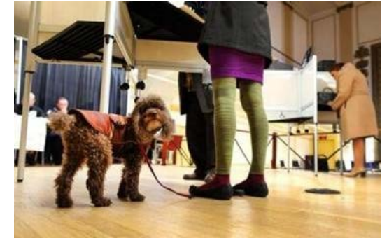
Scenes from Election Day in Boston