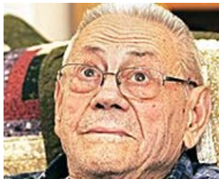
14 Benefits Most Seniors Didn't Know They Had Newsmax