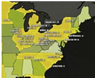
If You Ever Want to Retire Look at This Chart Money Morning