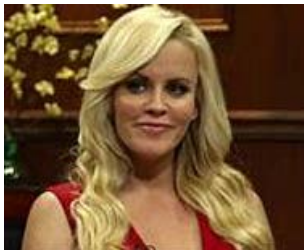
Jenny McCarthy Bares All Ora.TV