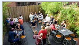
10 fun ideas for Fenway - Kenmore