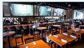
Changes to expect in and around Fenway