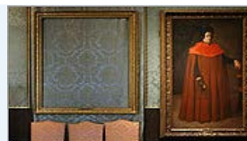
The Gardner Museum

For the latest updates about your community, follow some of our local neighborhood, city and town Twitter accounts, here .