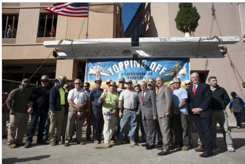
(Brooks Canaday / Northeastern News)

Matt Rocheleau can be reached at mjrochele@gmail.com . Looking for more coverage of area colleges and universities? Go to our Your Campus pages .