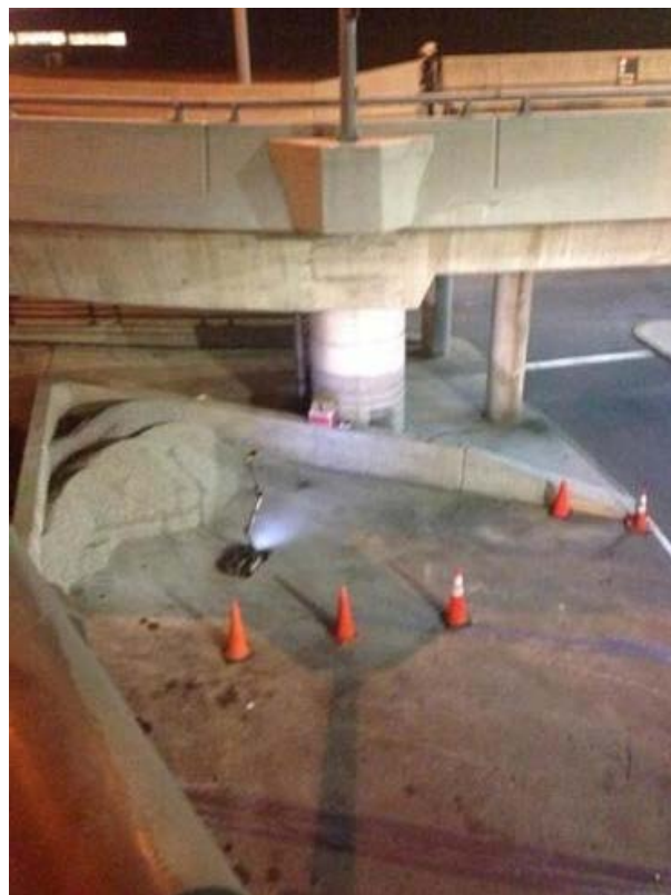
A passenger took this picture outside Terminal C, showing what appears to be a bomb squad robot approaching the suspicious package later cleared by State Police.

Matt Rocheleau can be reached at matthew.rocheleau@globe.com . Jaclyn Reiss can be reached at