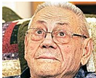
14 Benefits Most Seniors Didn't Know They Had Newsmax