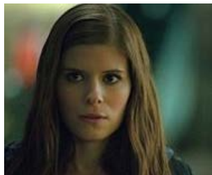
New 'House of Cards' Trailer is Everything You Hoped Netflix