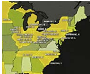
If You Ever Want to Retire Look at This Chart Money Morning