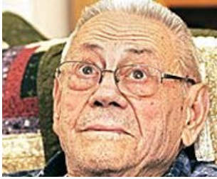
14 Benefits Most Seniors Didn't Know They Had Newsmax