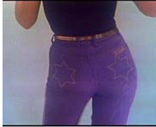
One of the Most Classic SNL Sketches of All Time Yahoo Screen