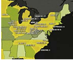
If You Ever Want to Retire Look at This Chart Money Morning