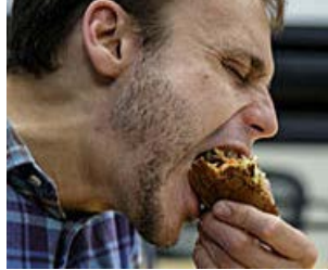
5 Foods You Should Never Eat Again My Diet