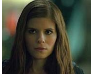
New 'House of Cards' Trailer is Everything You Hoped Netflix