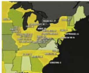
If You Ever Want to Retire Look at This Chart Money Morning