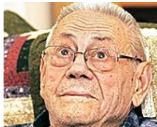
14 Benefits Most Seniors Didn't Know They Had Newsmax