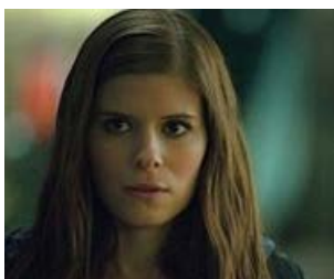
New 'House of Cards' Trailer is