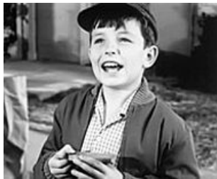
Famous Child Stars of '50s, '60s, '70s Where Are They Now?