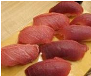
7 Healthy Foods that Turned Out to Be Unhealthy