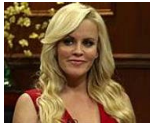
Jenny McCarthy Bares All