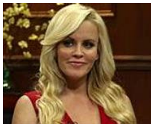
Jenny McCarthy Bares All Ora.TV