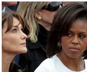
The End of Obama? Lifestyle Journal