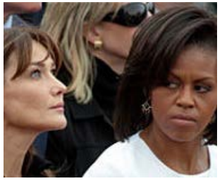
The End of Obama? Lifestyle Journal