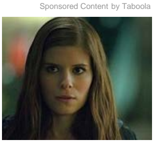
New 'House of Cards' Trailer is Everything You Hoped Netflix