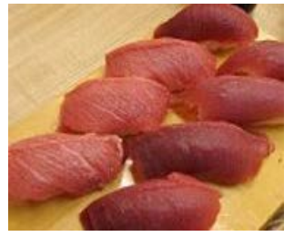
7 Healthy Foods that Turned Out to Be Unhealthy My Diet