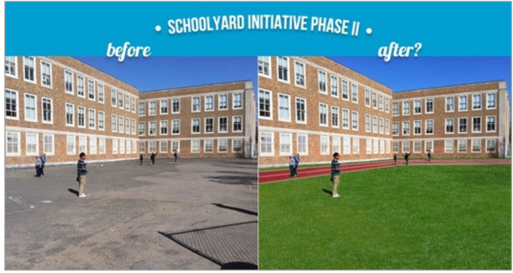
(Curley K-8 fundraisers)

For the latest Jamaica Plain updates: Follow @YTJamaicaPlain on Twitter, here . And connect via Facebook by clicking the "Like" button on the top right hand corner of the Jamaica Plain homepage, here .