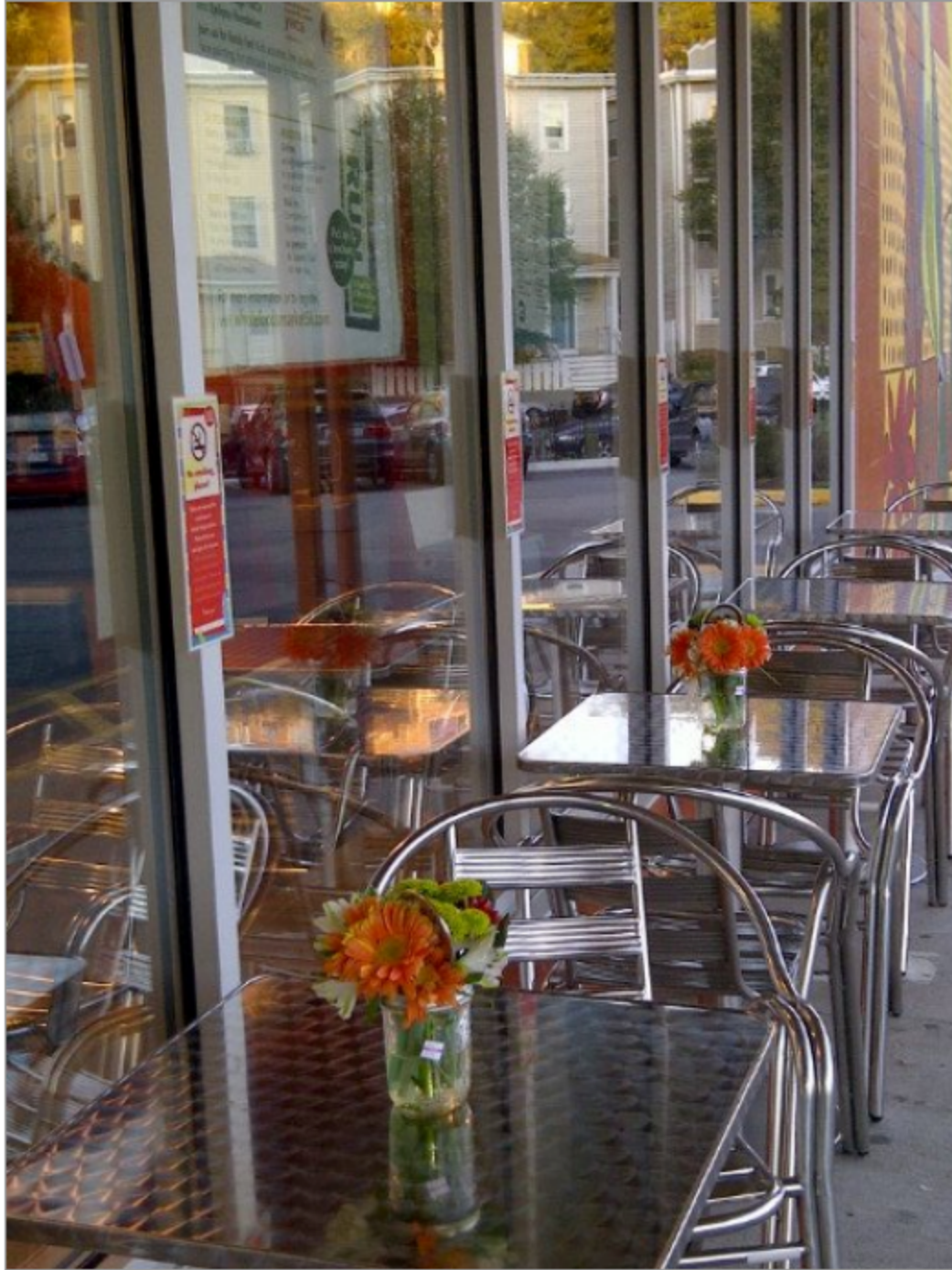
(Whole Foods Market, Jamaica Plain)

Follow other Boston.com Tweets | What is Twitter?