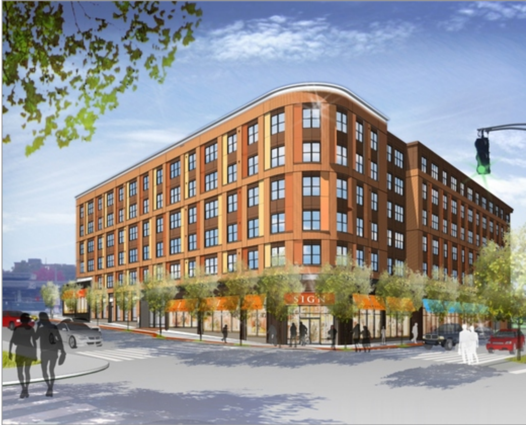
(City of Boston)

Follow other Boston.com Tweets | What is Twitter?