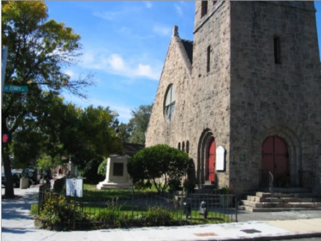
(Theodore Parker Church)