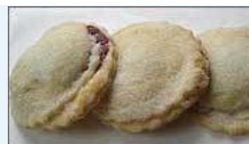
Cupcakes, cookies, and pastries at Sugar Bakery

View reader comments ( ) » Comment on this story »