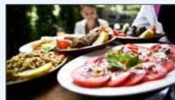
Find restaurants in West Roxbury