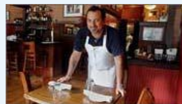
A cultural remix in West Roxbury