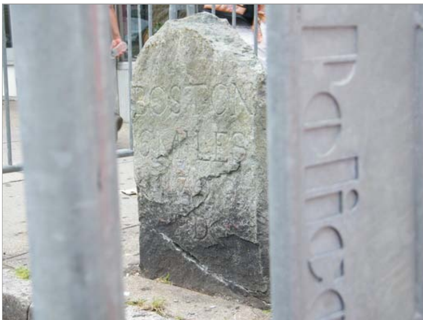
Above where it has been cracked, the 282-year-old, temporarily-barricaded stone reads "Boston 6 miles." Below that, "PD" stands for Judge Paul Dudley who installed the stone along with some others around Boston.