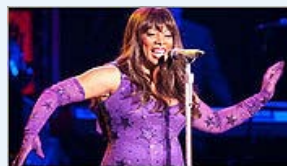
Notable Roxbury residents