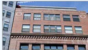
Residents face identity crisis