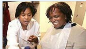
On the street where you live