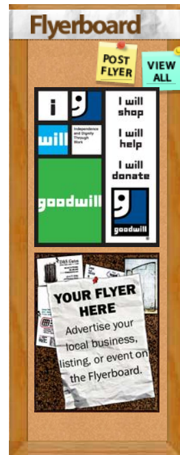
Local advertising by PaperG