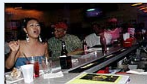
Diamond in the rough