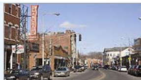
A night out in Jamaica Plain