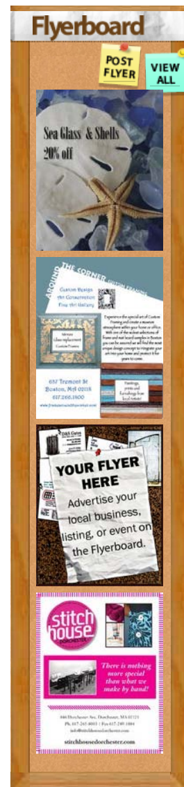
Local advertising by PaperG