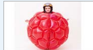
Are modern parents overprotective?

“We’re not normally a grocery-shopping service, but we’ll do whatever it takes to keep people cool,” she said as she rested in the air-conditioned common area of the Ausonia complex. The mayor’s office placed 28,000 automated calls to older residents to reinforce safe heat practices, and the Boston