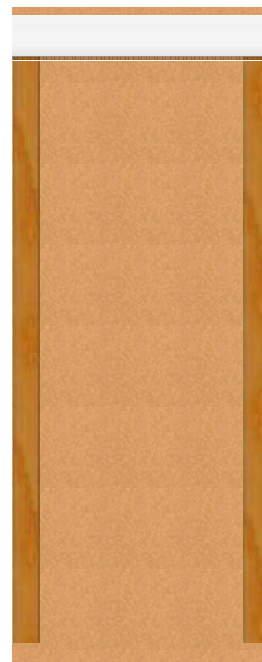
Local advertising by PaperG